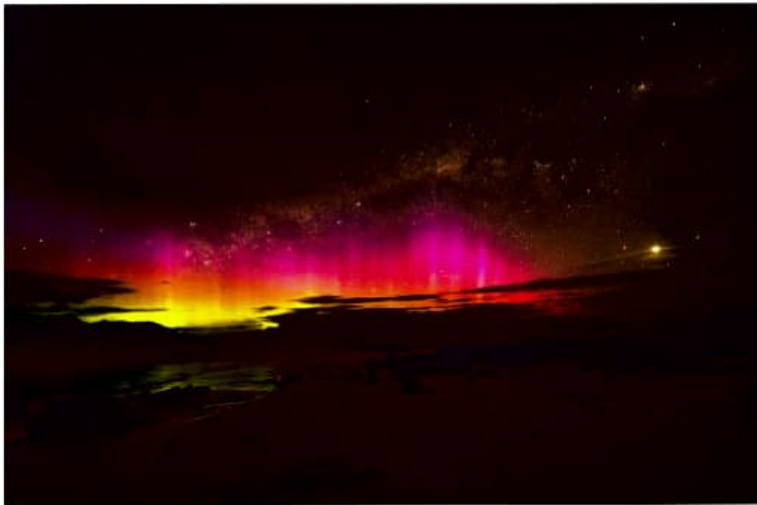
Southern Lights over Cloudy Bay, Tasmania

Tasmania, with its gleaming white sand beaches, hopping wallabies (mini kangaroos! ), and some of the purest air on the planet, is one of Australia's most underappreciated regions. This is the furthest south one can go in Australia, and it offers the best chances for aurora activity. From the mainland, it's surprisingly inexpensive to get there. Even if you don't see the aurora, the stunning scenery and adorable wildlife make the trip worthwhile.