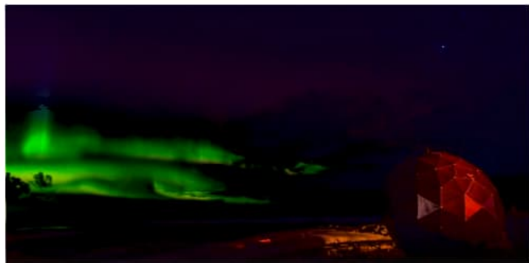
Southern Lights over a satellite dome in Antarctica

Antarctica is quickly attracting visitors due to its pristine state. Turquoise glaciers, waddling penguins, and stunning snowy hills inhabit the eerily barren landscapes. This part of the world truly does appear to be otherworldly. It costs a lot of money and takes a lot of effort to get here, but it is undeniably a once-in-a-lifetime opportunity.